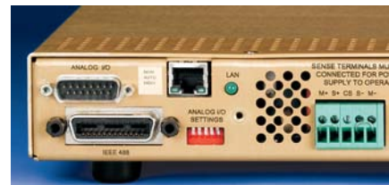
Rear view, Ethernet (LAN) port, -1.2K version

Kepeco provides three instrument drivers: IVI-COM, LabView G and VXI plug&play, which simplify programming of the KLP power supply via the digital interfaces. These drivers and sample programs are supplied on a CD shipped with each unit and may be downloaded from the Kepeco website at: www.kepcopower.com/drivers .