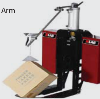
Package Support Arm